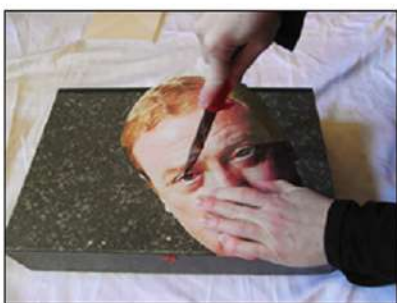
Step 4: Use a sharp knife to cut out the eyes.