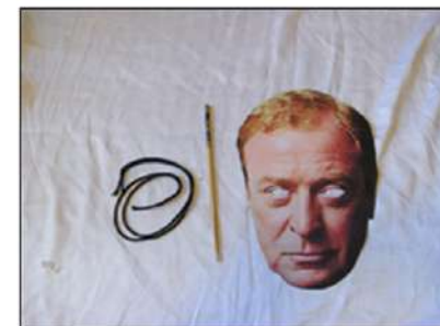
Step 1: You will need two pieces of string and a chopstick or similar.