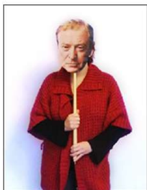
Hold your mask in front of your face.