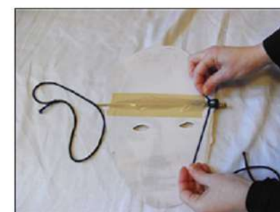
Step 3: Tie each piece of string to each end of the stick.