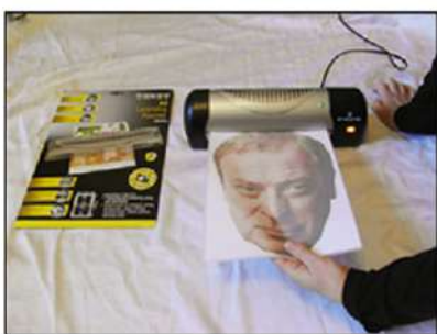
Step 2: Laminate your mask.