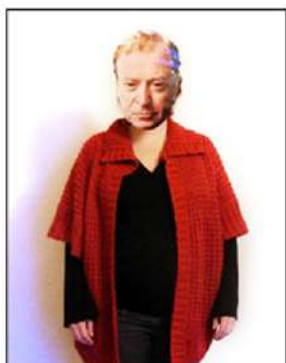
Step 4: Tie the mask tightly around your head.