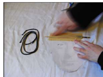
Step 2: Tape the chopstick just above the eyes of the mask.