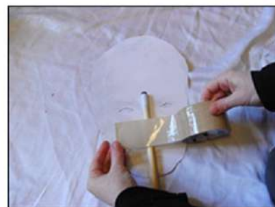
Choose a suitable stick and tape it to the back of the mask.